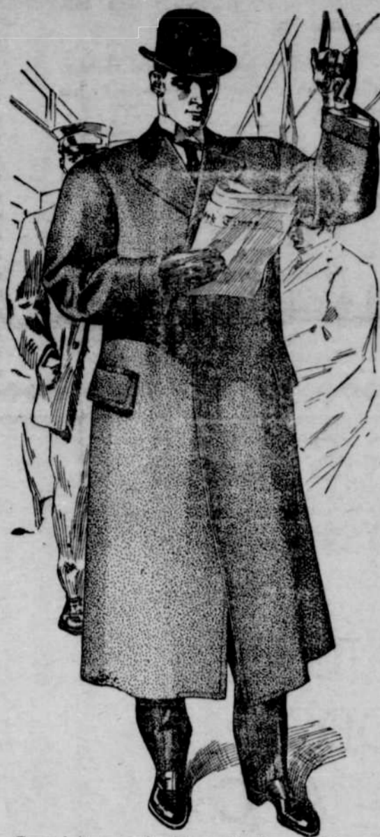
Copyright 1907 by Hart Schaffner & Marx

Among the lot of coats are the famous Hart, Schaffner's & Marx cravenetts, none better made. You will have to see them to appreciate them. Every coat new this season