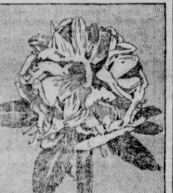
RHODODENDRON HYBRID MINNIE

Collected and Shipped From their Natural Habitat - The Hybrids. While the hybrid rhododendrons must produce the varied coloring that is sought for from this class of plants there has been a revolution of feeling as to the use of these plants within the last few years, due to the extensive production and successful cultivation of collected plants of Rhododendron maximum. The collecting and shipping of this plant, together with that