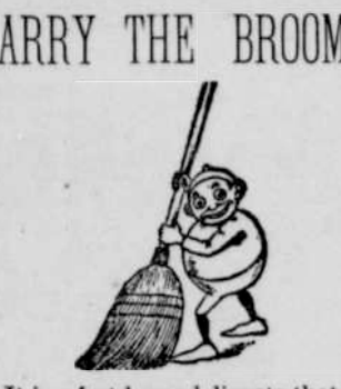
PATTON BROS., SALEM,

Are fully entitled to carry the in signia of championship when omes to having by far the large