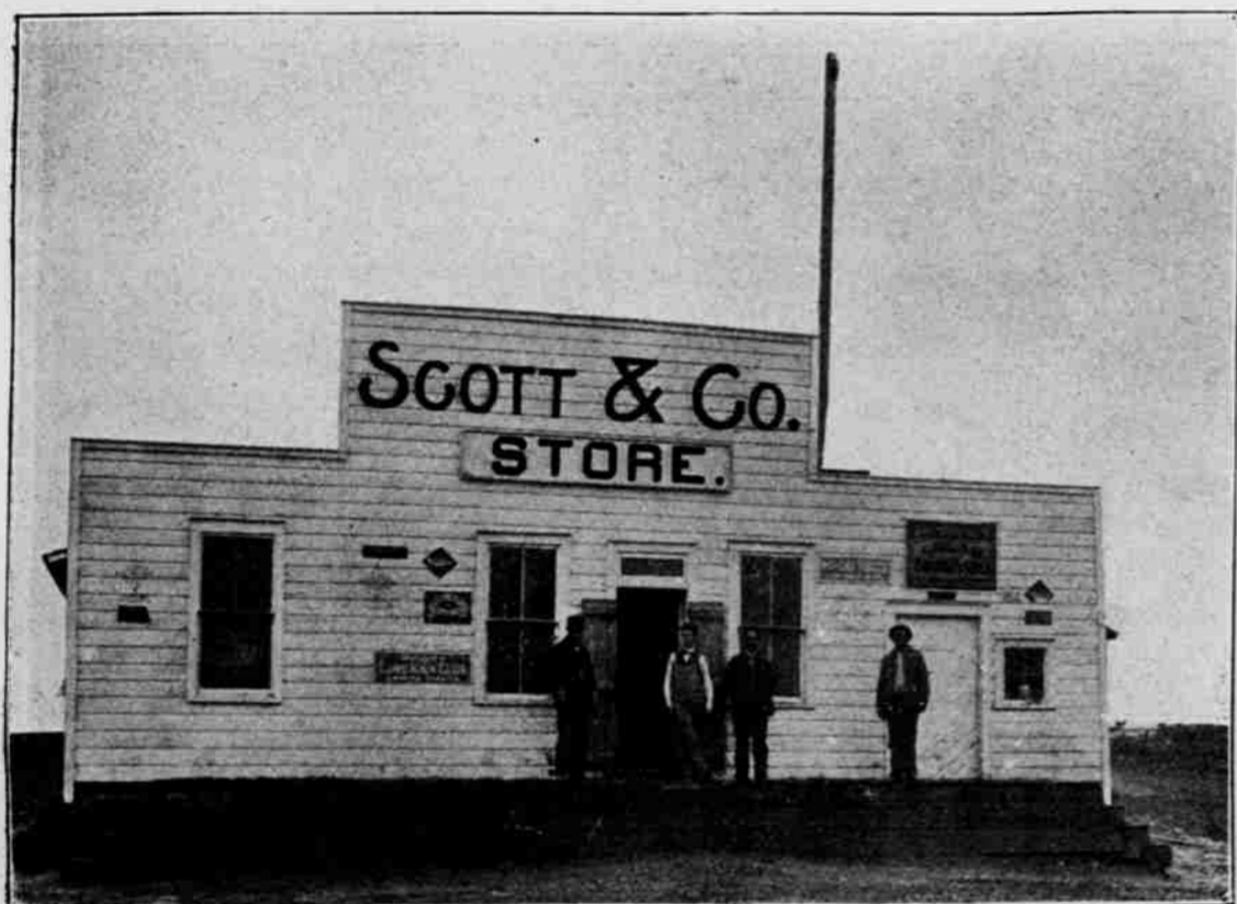
STORE OF SCOTT & COMPANY.