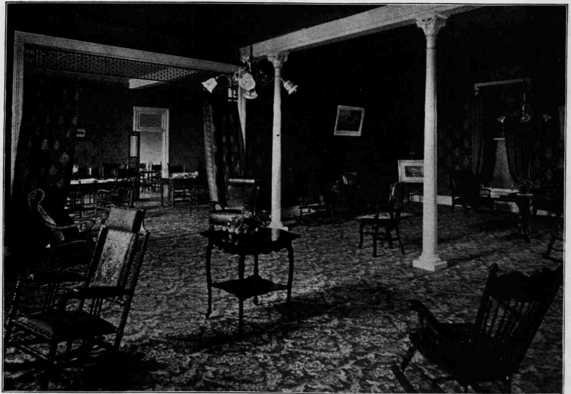
THE DALLES COMMERCIAL AND ATHLETIC CLUB ROOMS.