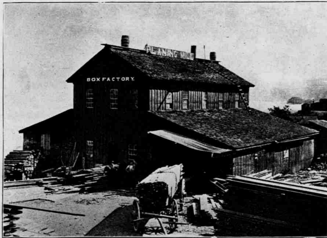
J. T. PETERS &amp; CO.'S PLANING MILL.