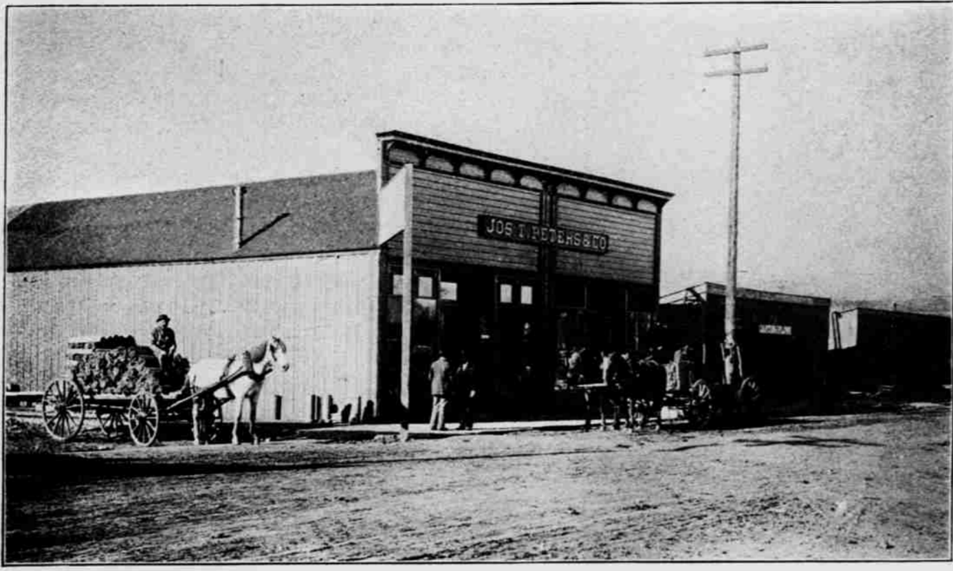
J. T. PETERS &amp; CO.'S STORE.