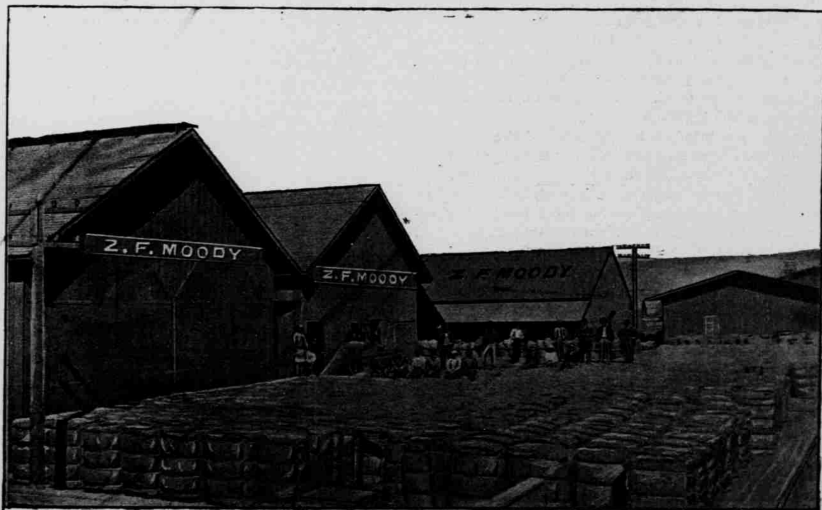
REAR MOODY'S WAREHOUSES IN WOOL SEASON.