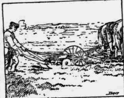
WING'S FRENCH PLOW IN USE.