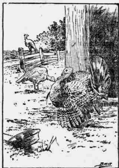
AS IT USED TO BE.

"Yes," says he, "we used to raise a smart lot of turkeys round here. "The weasels, minks and hawks got some, but these all fired smart town chaps got to huntin' round our fields and timber and shootin' our turkeys and takin' 'em home, and passin' 'em off for wild turkeys, and we got tired of it and quit." "Then," continued the farmer, "it brought on so much scrapin'." "Well, of course," we innocently replied, "turkey toms will scrap, and