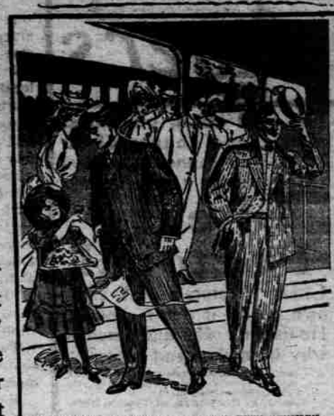
CONTROLT 1905 BY CROUSE & BRANDEGEE, UTICA, NEW YORK.

We contend that our clothing embraces about all that the word "clothes" implies. It is not mere covering for the body for hot and cold days, but it is a recognized correctness