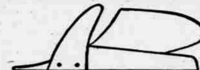
FLOW SHARE WITH FIN COULTER.

The cut herewith illustrates a style of plow coulter which is often used in the West. It is made from high-grade crucible steel about three-eighths of an inch thick, and cuts through the soil easily. There are certain conditions under which the rolling coulter will not work well, and then the fin coulter can often be used to good advantage. Years ago the land side of the share was always dovetailed and the cutter set in level, but later manufacturers and blacksmiths have simply riveted or bolted the steel to the share without dovetailing. This is cheaper than dovetailing, but the latter method causes the plow to run better than when the cutter is bolted to the side. The fin coulter is always slanted well back and is rounded back at the top. When made in this form, wear does not so soon impair its usefulness as if the