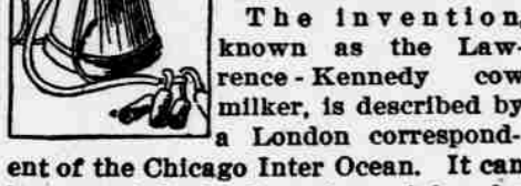
Automatic Milking Device. The buxom dairy maid will soon be a thing of the past if a new invention which has successfully undergone