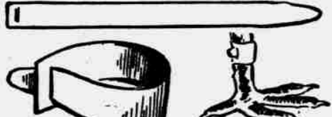
POULTRY LEG BAND.

The illustration shows a neat and durable leg band, which is easily put on, and one which will be no inconvenience to the fowl. It is made from a 2-inch strip of tin pointed at one end, and a hole made through the larger end. If it is desired to have a number or letter on the band, cover the