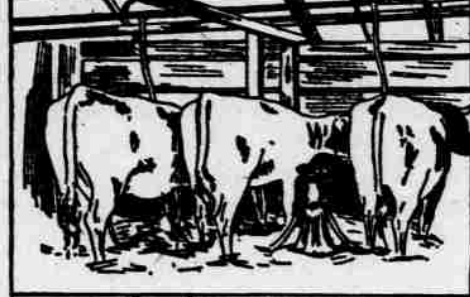
Automatic Milking Device. The buxom dairy maid will soon be a thing of the past if a new invention which has successfully undergone