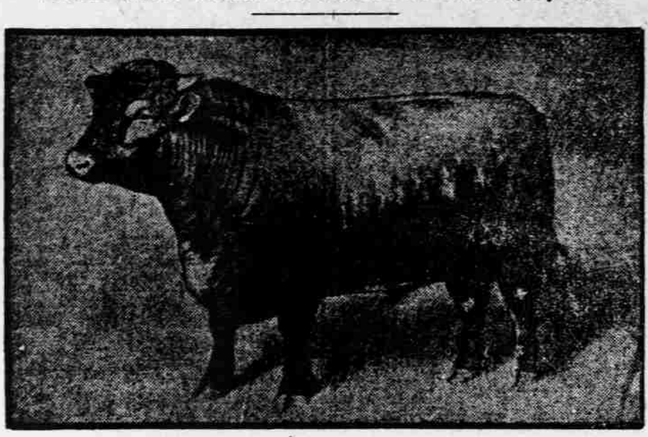
Prince Ito, an Aberdeen Angus bull, was sold in the action ring at the Union stock yards, Chicago, for $9,100. This is the highest price ever paid for such an animal.

"Oh! I don't know," she said as she held it in both hands pressed against her cheek. "I might."