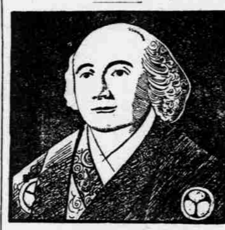
THE WASHINGTON PORTRAIT.

One of the most interesting bits of old pottery in existence is a rare piece of Chinese porcelain in the New York Metropolitan Museum. It was made by a Chinese artist more than a century ago and bears a quaint portrait of George Washington.