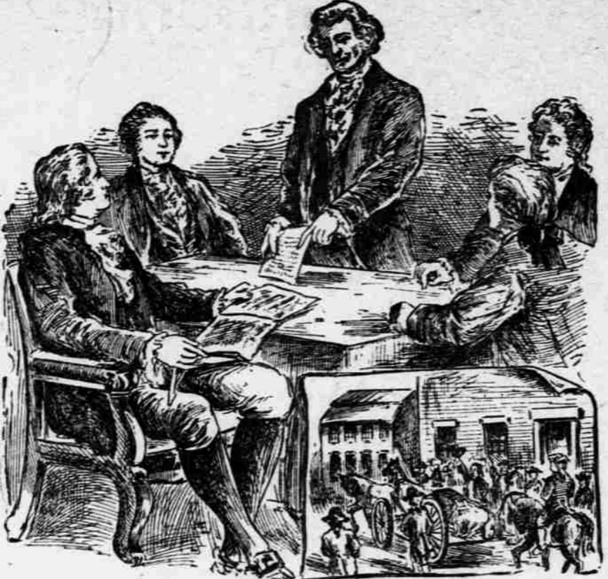
KNOX, HAMILTON, RANDOLPH, JEFFERSON.

There is not much of aristocratic state surrounding Washington and his first cabinet. They regarded the proper ruling of the young republic as very serious business, and gave no thought to style, furbelows and silly flourishes.