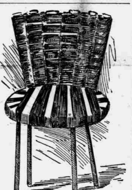
A DOLL'S CHAIR—FIG. 2.

top of the one leg, just under the seat, and wind round and round it tightly and smoothly. On arriving at the end, turn back and wind over again to the top. Now carry the wool over to the opposite leg and proceed in the same manner until all four are completely covered.