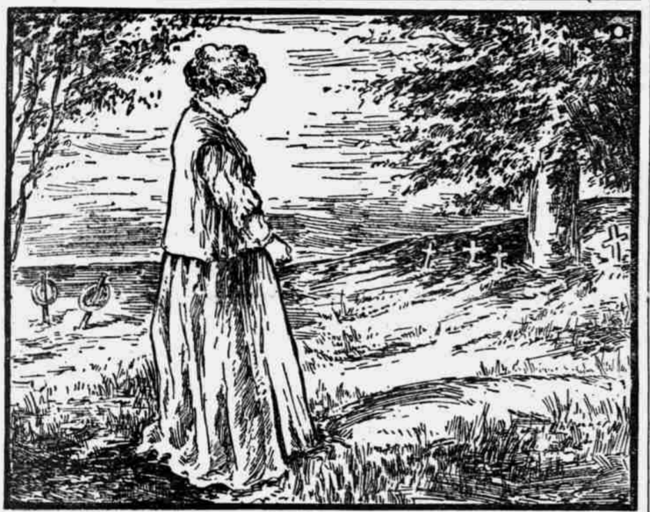
"I CAME UPON A GRAVE."

"Where is Olivia?" he muttered, in a hoarse and labored voice. "I am here, Richard," I answered, falling on my knees where Tardif had been kneeling, and putting my hand in his; "look at me. I am Olivia."