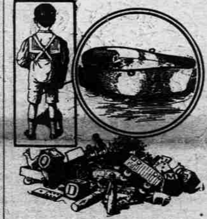
THE PRESIDENT AND THE WEEK.

How a Bank Robber Was Brought to Justice. "One of the most remarkable captures in the history of my experience," said a well-known detective, "happened some years ago, and I need not mention the place nor the circumstance in connection with the case. It was in a case where $30,000 had suddenly and mysteriously disappeared from a bank."