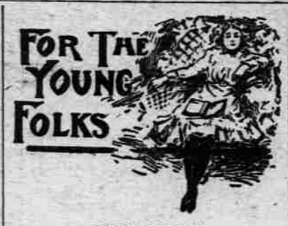
FOR THE YOUNG FOLKS

never conquer it. Do you think that is true? Be candid with us." "Yes," I answered, "it is true. I could never love again as I love Olivia."