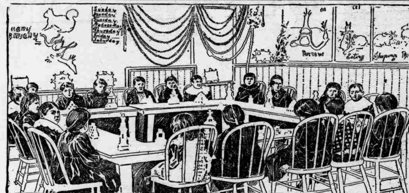
EDUCATING YOUNG LATTER DAY SAVAGES.

development. In like manner his face is without that complete development of nerve and muscle which gives character to expressive features; his face seems stolid because it is without the mechanism of free expression, and at the same time his mind remains measurably stolid because of the very absence of mechanism for its own expression. In short, the Indian instincts and nerves and muscles and bones are adjusted one to another, and all to the habits of the race for uncounted generations, and his offspring cannot be taught to be like the children of the white man until they are taught to do like them. The children of our aboriginal land holders are now wards of the nation, and in the minds of most right-thinking people they are entitled to kindly consideration."