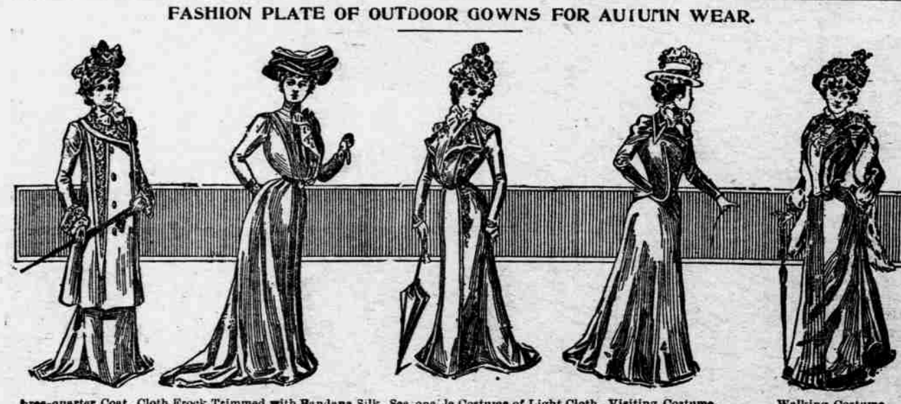
FASHION PLATE OF OUTDOOR GOWNS FOR AUTUMN WEAR.

A girl may keep quiet on the subject of her intended's income until after their engagement is announced, but that is the turning point for boasts or wails.