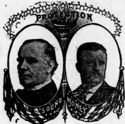
For President: WILLIAM MCKINLEY of Ohio.