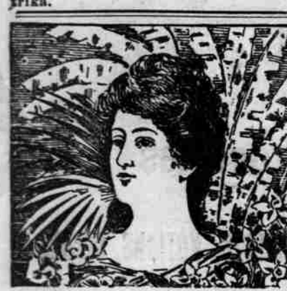
An Excellent Combination.

State Turtles. Turtles are very largely tound along the coast line of Burma and the impe cunious government has found means to make money out of it. The right to collect turtles and eggs is sold by auction annually by the deputy commissioners within whose districts the banks are situated. The revenue from this source in the Irrawaddy division alone was about 28,000 rupees. For some time past a decrease in the number of turtles and tortoises has been noticed and the government now pro poses that the islands on which the tortoises lay should be completely pro tected from January 1 to May 15 (the faying and hatching season) once in every five years and that a small establishment should be maintained for this purpose,-Calcutta Amrita Bazar Pa-