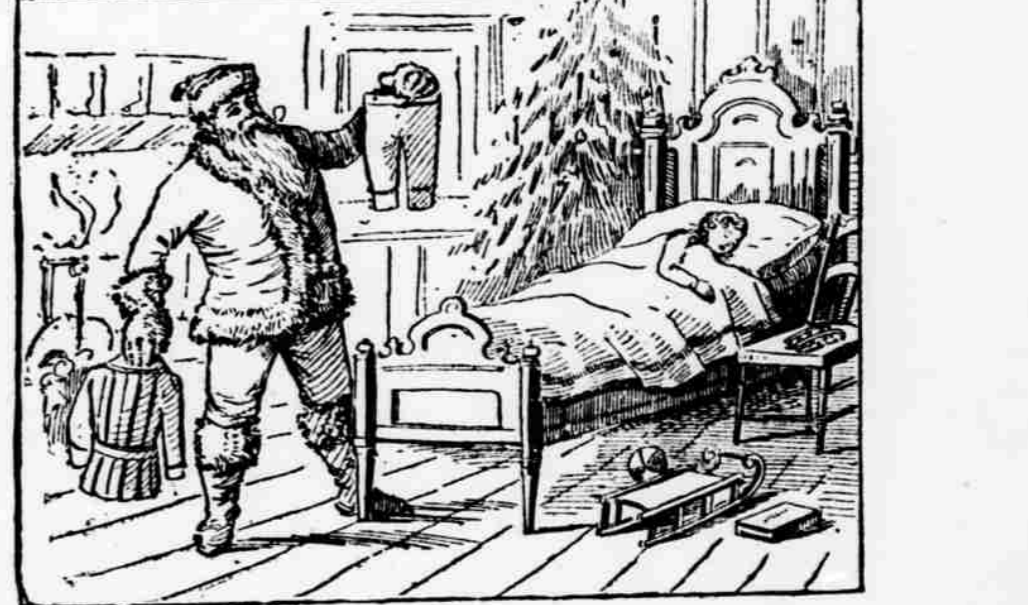
The cut suggest the merry time soon coming, when many will be made glad by some token of love or friendship.