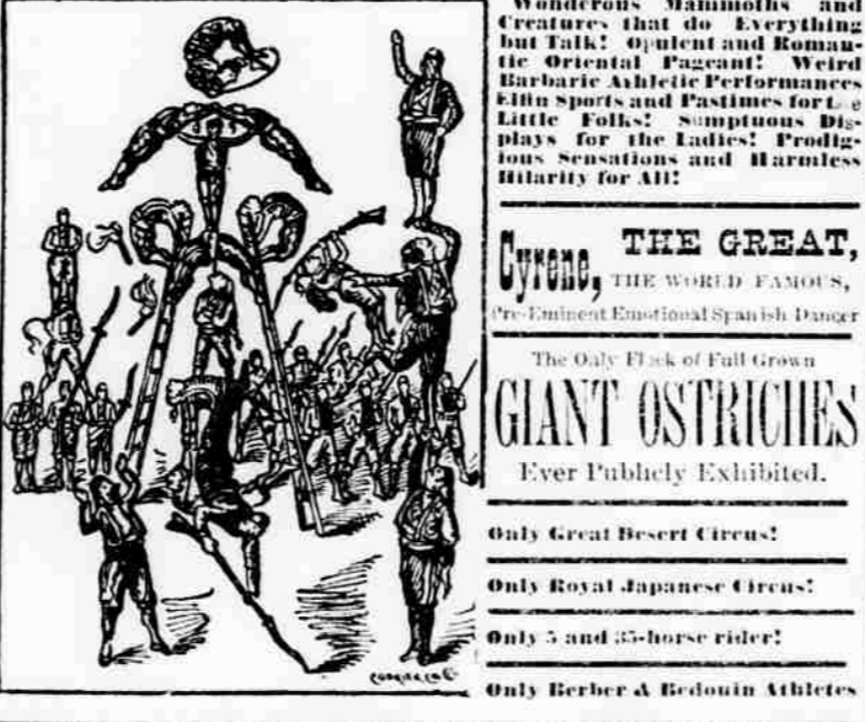
Wunderous Mammoths and Creatures that do Everything but Talk! Oriental and Romanic Oriental Pageant! Wild Barbic Barbaric Performances! Wild Sports and Pastimes for the Little Folks! Stupendous Displays for the Ladies! Prodigious Sensations and Harmless Rivalry for All!

Three Circus Kings! Double Elevated Stage! Thrilling High Air Novelties! Grotesque Carnival! All kinds of Colossal Wild Beasts and Classic Races! All the Most Illustrations Artists and Brilliant Acts!