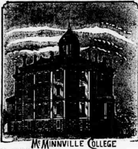
McMINVILLE COLLEGE, McMINVILLE, OREGON