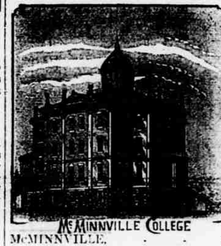
McMINVILLE COLLEGE McMinnville, Oregon.