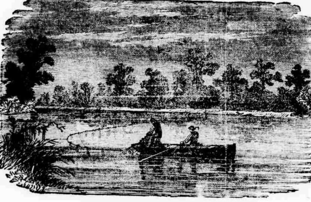
SALMON FISHING AT YAQUINA.