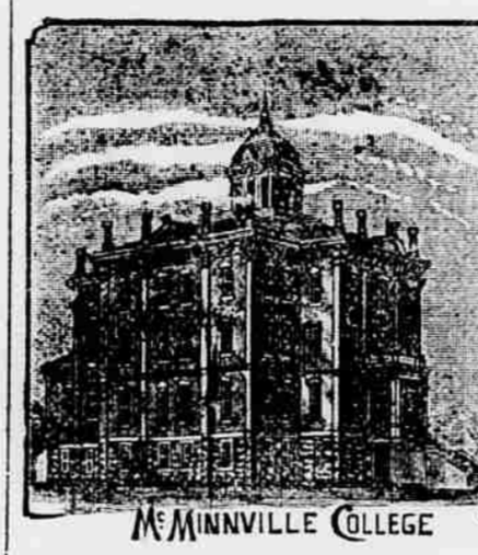
McMinnville College, McMinnville Oregon. Six courses of study—two of four years each, two of three, and two of two years.

Paine's ULLERY COMPOUND CURES. Neuralgia, Rheumatism, All Liver Disorders.