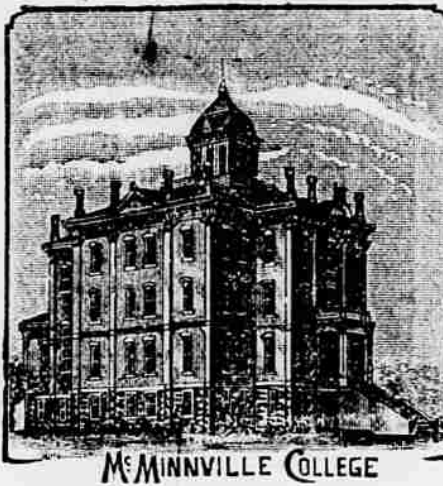
McMinnville College, McMinnville Oregon.

DIAMOND PAINTS. Gold Silver, Bronze, Copper. Only 10 cents.