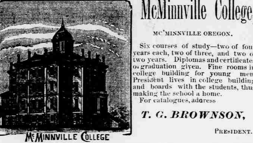
McMinnville College, McMinnville Oregon.

PREPARED BY THE CASTORIA COMPANY, 77 Murray St., New York.