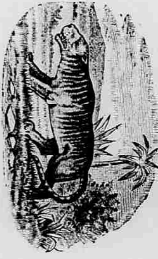
THE TIGER HAT

HATS FOR MEN AND BOYS AT L. E. BLAIN'S. NOBBY SOFT HATS, FASHIONABLE STEEP HATS!