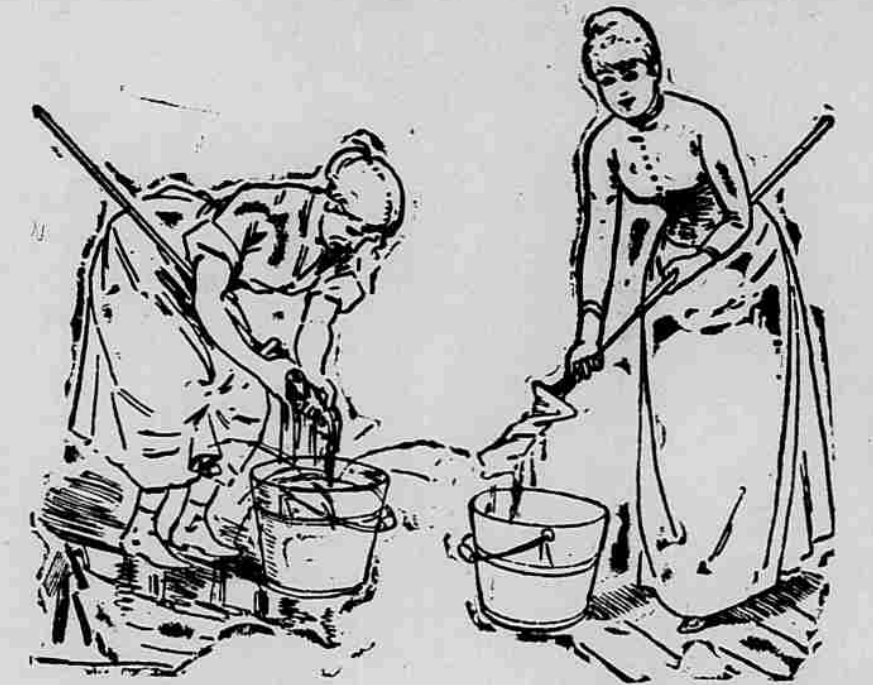
THE NEW WAY

Every housekeeper knows from experience the hard labor required to wash floors and wring the cloths by hand. By using the Newton self-wringing floor cleaner, wringing the cloth by hand is avoided, the hard labor is thereby lessened; the hands do not come in contact with the water, whereby you can use boiling and ammonia water. The Newton self-wringing floor cleaner is light, durable and simple in construction, and well merits the claim of being the best invented. Special rates to canvassers and the usual discount to the trade. Manufactured and sold by LOUIS VIERECK, Albany, Linn County, Oregon.