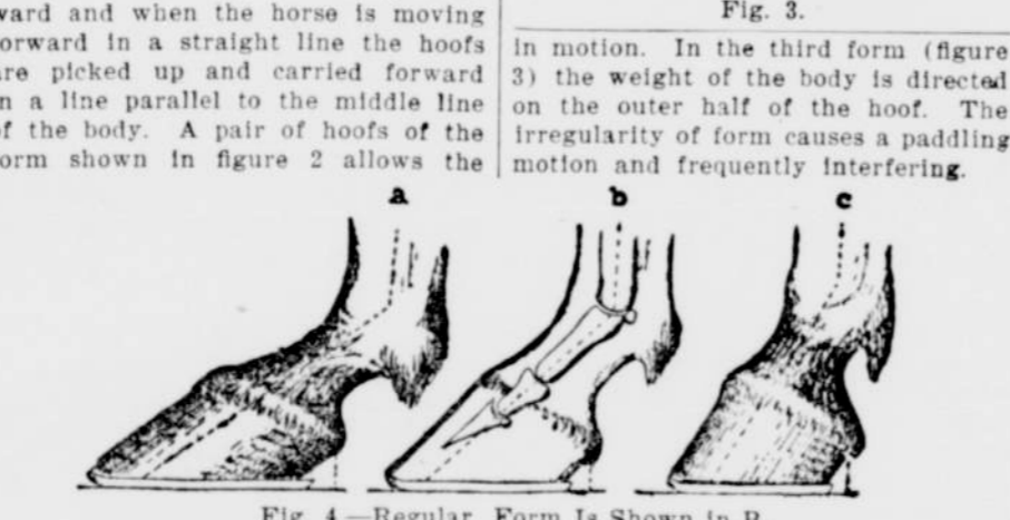
Fig. 4.—Regular Form Is Shown in B.

weight to fall largely into the inner half of the hoof. In motion the hoof is moved in a circle. Horses that are "toe-wide" are likely to interfere when in motion. In the third form (figure 3) the weight of the body is directed on the outer half of the hoof. The irregularity of form causes a paddling motion and frequently interfering.