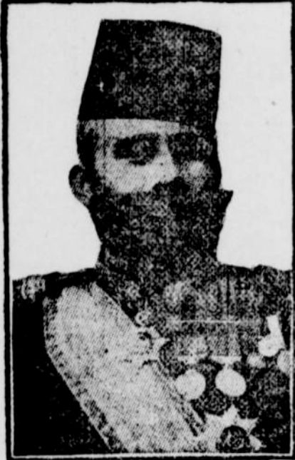
MUHAMMED SCHEFKET PASHA.

Schefket Pasha is a tall, wide shouldered, thin Arab of Bagdad, with some Georgian blood. He has been described as a man of extreme composure. "Some of the members of the committee," said Rauf Bey, one of the three who represented the Young Turk committee in the navy, "before the advance on Constantinople doubted whether Schefket Pasha was the man for the work ahead. He was so