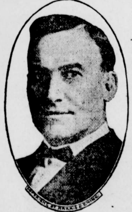
ARTHUR PHILLIPS MURPHY.

Arthur Phillips Murphy, or "Pat" Murphy, as he is known in his home town, Rolla, Phelps county, Mo., went to Washington four years ago as a representative in congress and soon became known as "Homespun" Murphy, from a nut brown, rough suit of clothes he wore. Since then he has developed into one of the high lights of the house and has won fame as a champion of the laboring man. He was a candidate for re-election to the Sixtieth congress, but his Democratic