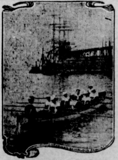
FAIR EXPERTS IN OARSMANSHIP.

It is said by scientists that each year brings a difference in temperature from the preceding year, and while New York is gradually becoming warmer California grows the faintest degree colder. As the matter stands now, however, winter in California is more like a prolonged summer than anything else. Except that the dates on the calendar tally with those that mark a blustery day in New York, there is little to suggest that the season has changed. Although the temperature varies in different parts of the state, really cold days with frosts