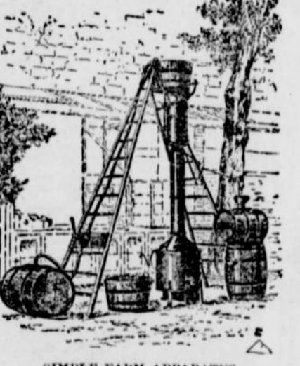
SIMPLE FARM APPARATUS.

A great deal of the alcohol making in France appears to be done by trav-