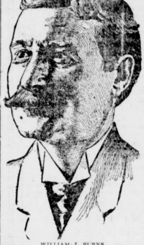
WILLIAM J. BURNS.