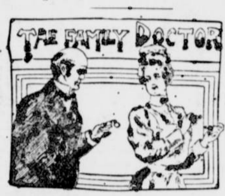
THE FAMILY DOCTOR