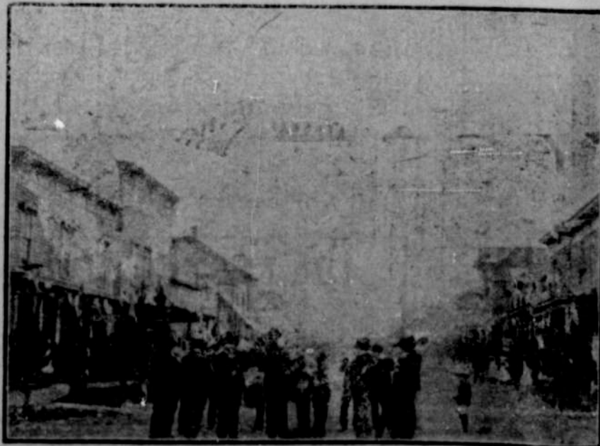
Street Scene in Bandon, From an Old Photo.

This paper for sale at this office. Price, 10 cents each, three for 25 cents, postage or coin.