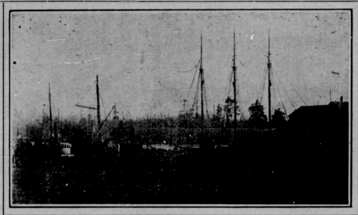
Vessels Loading at Central Warehouse.