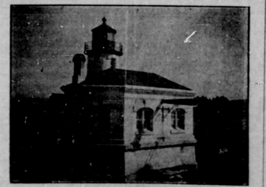
VIEW NO. 3. Lighthouse at Entrance to the Coquille.