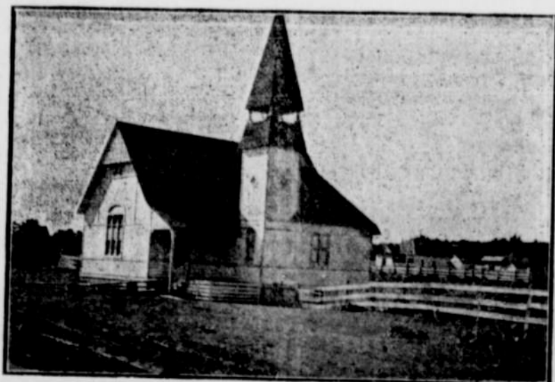
PRESBYTERIAN CHURCH, BANDON.