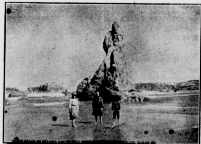
FUN FOR THE LITTLE FOLKS ON BANDON BEACH.

Present conditions in southwestern Oregon demand suitable facilities, and so soon as they are obtained rapid progress will be made in a score of industries for which the natural resources of the country has so well prepared it. A wealth of the finest granite and marble will lay untouched; hundreds of square miles of valuable timber will stand uncut; quarter sections of land superbly suited to stock raising and dairying will remain covered with scrub growth; coalfields, prospected but undeveloped, will continue in their primitive state, unless adequate means to get the goods to market are supplied. The railroad is going to be built down the coast and the fact is gratifying. It will be the sure means of adding to the state of Oregon wealth which now lies hidden.