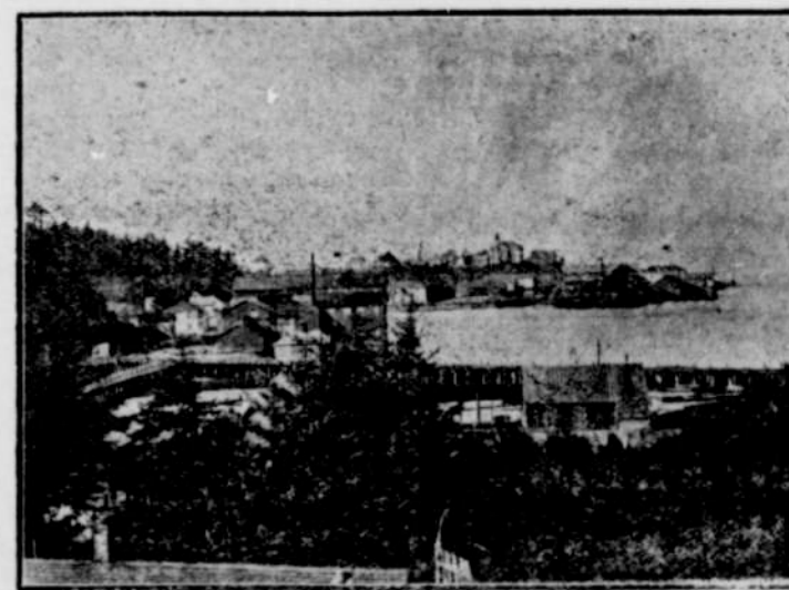
View of Business and Manufacturing District, Bandon.

The industry here is the second largest in the state--being next to the Columbia. Over $1,300 in license was paid to the state this year. An effort is being made by the fishermen to have a hatchery established on the river and no doubt their efforts will be successful.