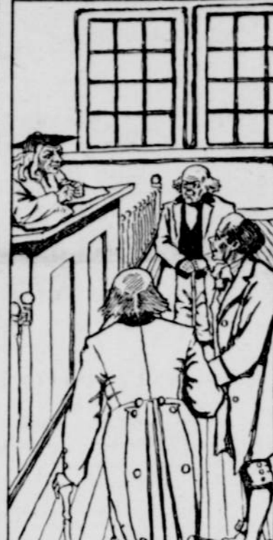
I'm afraid your memory can't compare with Conal's and Donal's.

"But I'll tell you what I'll do, now," says he, "I'll give the field to whichever of you has the keenest sight." "Then," says Conal, says he, "it's me gets the field, because," says he, "if