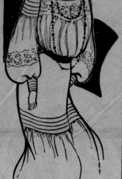
MADE OF JAPANESE LINEN.

WOMAN AND FASHION A Morning Gown. Morning gown of blue Japanese linen trimmed with Japanese embroidery in white mercerized cotton. The embroidery occurs as inserted bands in bodice