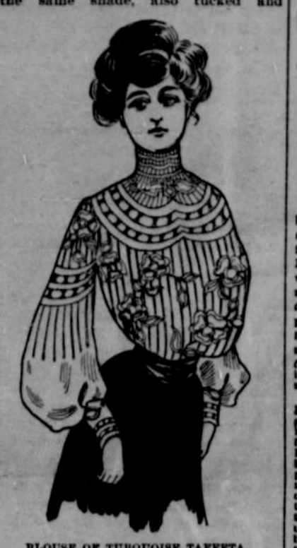
BLOUSE OF TURQUOISE TAFFETA. Trimmed with the applique and bordered with three festooned bands of the taffeta united by gimping.

A Charming Waist. The illustration shows a blouse of turquoise taffeta tucked all over in the tucks and trimmed with applications of cream lace in a rose design. The gimp is of mousseline de soie of the same shade, also tucked and