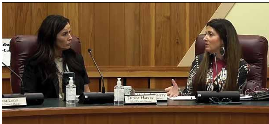
Smoke Signals screenshot

The second clinic, a former dental office at 3580 S.E. 82nd Ave., is nearing the end of renovation and