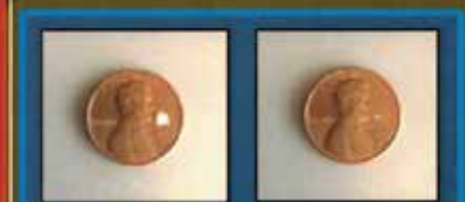
Fatal dose of Fentanyl!

Naloxone is ineffective on this conditions.