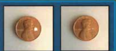
Fatal dose of Fentanyl! Fatal dose of carfentanil!

Naloxone is ineffective on this conditions.