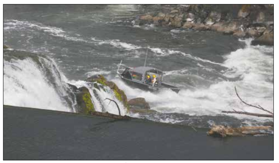
The boat carrying Tribal members forges through the rapids at Willamette Falls on the first day of fishing on Tuesday, May 4.