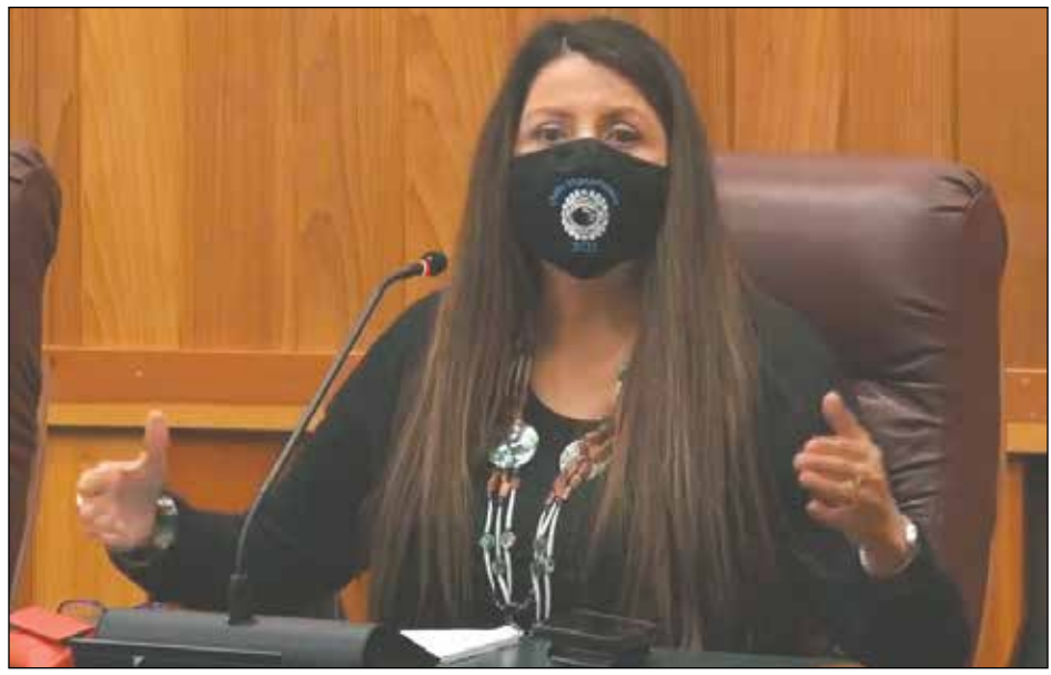
Smoke Signals screenshot