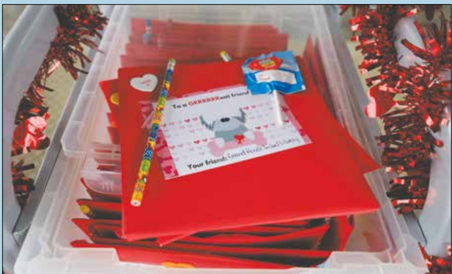
Wrapped books for children wait to be distributed.