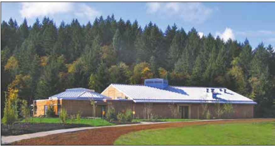
Lane Community College Longhouse